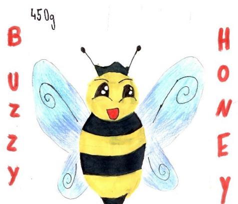
11 – 16 class