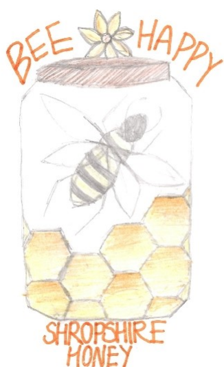
under 11 class